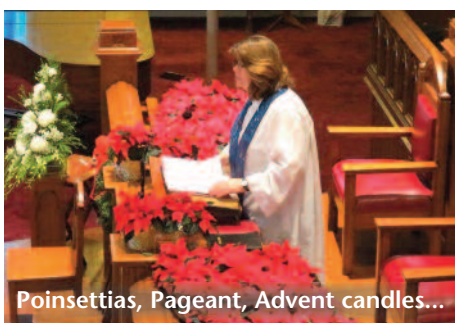
Poinsettias, Pageant, Advent candles...