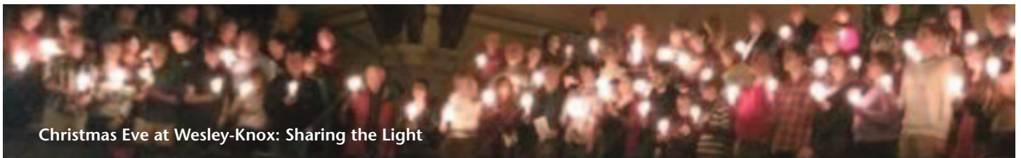
Christmas Eve at Wesley-Knox: Sharing the Light